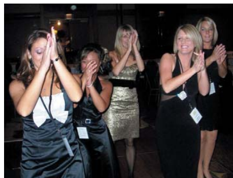
A little line dancing is always a hit at a gala celebration.