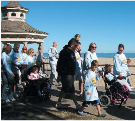
It was blue as far as the eye could see as young and old raised funds for the Agency.