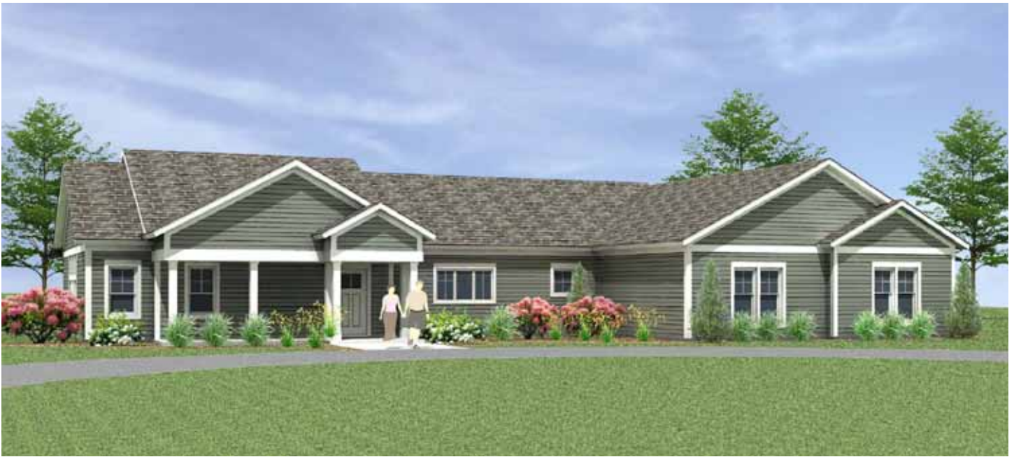
The new English Road Residence is under construction. The staff and nine residents hope to move in at the end of the year.